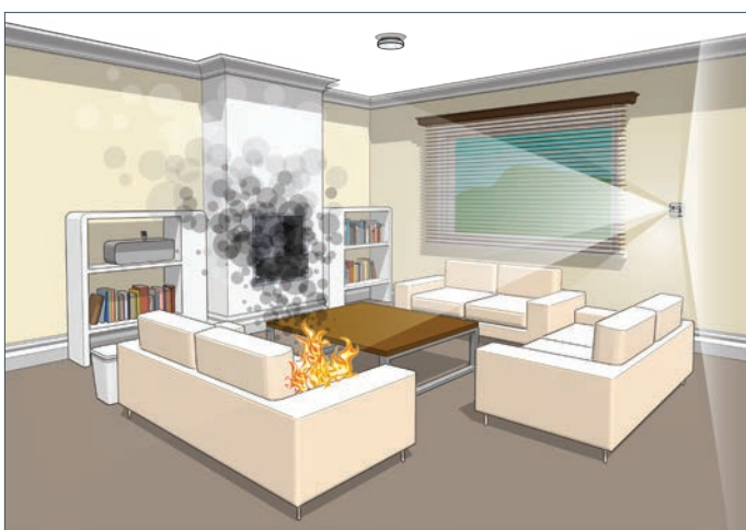
Tackling domestic fires even in open spaces

In cases where fire suppression is only required in localised areas, Automist® represents an affordable choice without the need to install a building-wide system.